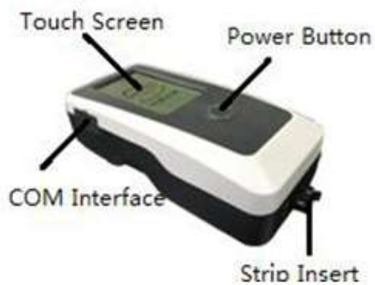
Quantitative Mycotoxin Analyzer