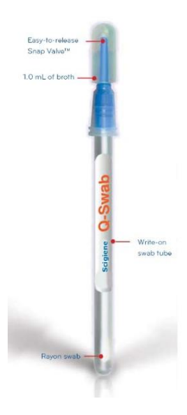
Q-Swab - Environment Swab Collection System with Letheen Broth Sterile Cellulose Sponge w/handle - Letheen Broth

*Recommended use: Recovering bacteria from the solutions containing residues of sanitizers from food utensils and equipment.