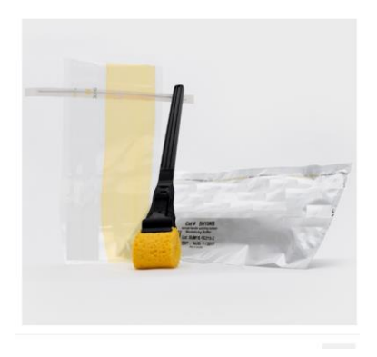
Scigiene Sterile Cellulose Sponge w/handle and neutralizing buffer

*Recommended use: Neutralizing Buffer is recommended for detection of microorganisms found on dairy and food equipment disinfected with chlorine or quats. It is also recommended for the digestion and decontamination process of mycobacteria during TB diagnoses<sup>1</sup>. Decontamination and digestion of the mucous components kills contaminating normal flora and allows slower growing mycobacteria to grow. Timely neutralization prevents potential loss of mycobacteria caused by high pH levels of decontaminants, resulting in the preservation of more viable organisms for diagnostic protocols.